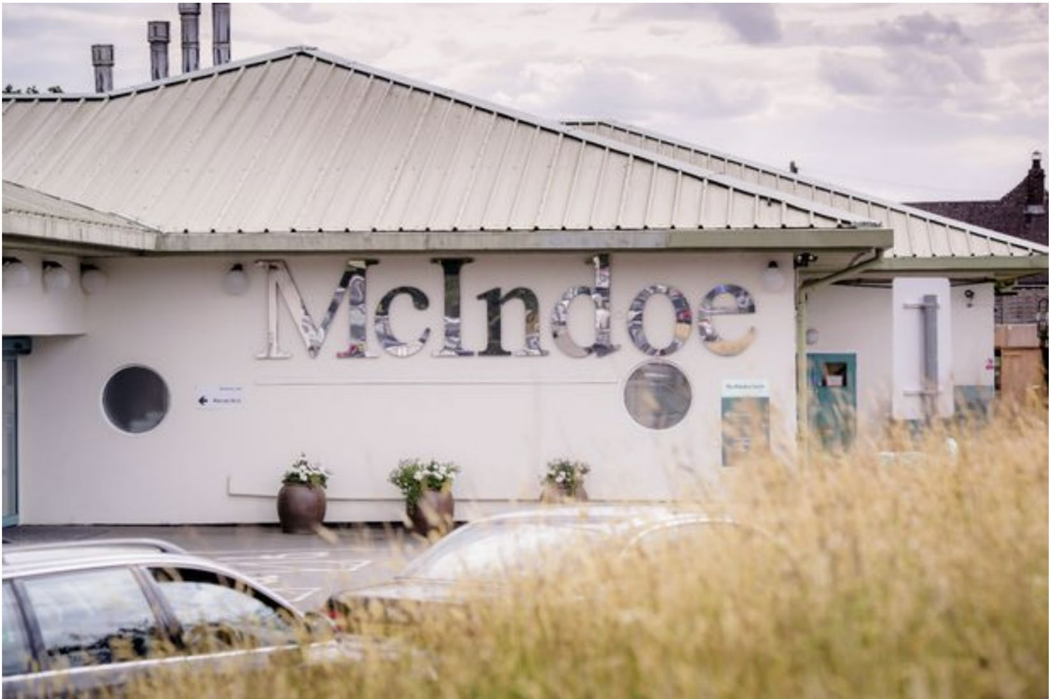
📍 You can find the McIndoe Centre in East Grinstead

The team is committed to treating everyone who enters its doors with kindness, respect and dignity - with the satisfaction of patients as the centre's priority.